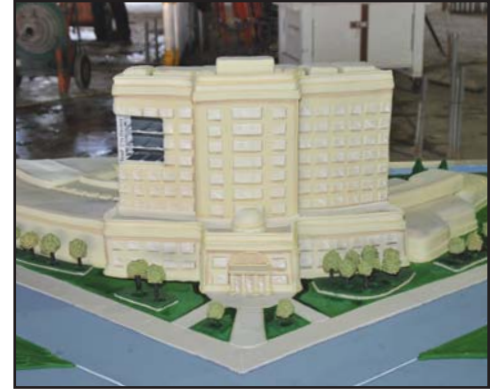
A cake replica of the Juvenile Justice Center

The Scandinavian custom began over 1,000 years ago when, after the Vikings completed building their homes, they hoisted an evergreen tree to celebrate.