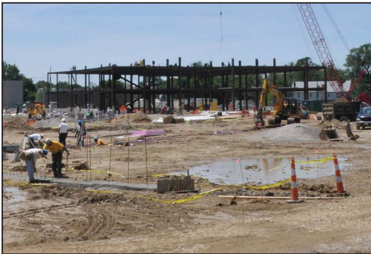
Main Level East Area