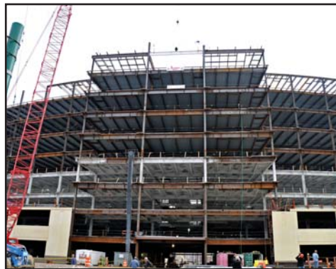
Raising the beam